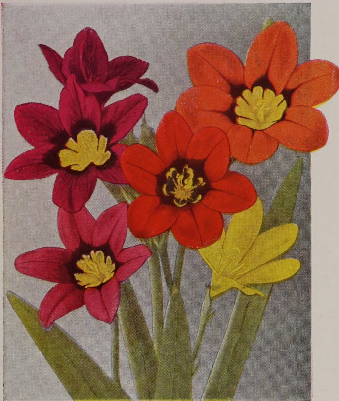
SPARAXIS (Tecolote Hybrids)